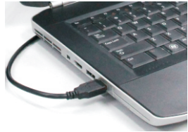
Connect Type A plug to the PC.

Connect the PAD to the PC using the supplied USB cable. The MaxiTPMS PAD program will always prompt you to connect the PAD before letting you start the process.