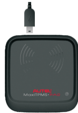
Connect Type B plug to the PAD.